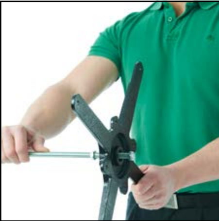
Table base assembly instructions